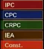
Law Books & Codes